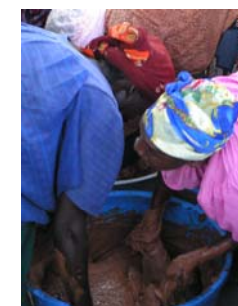
Agricultural success from the bottom up: Backyard production of shea butter by women in Burkina Faso