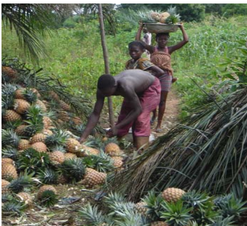
Pineapple sales, Benin

An important priority sector of NEPAD is agriculture & food security as captured in its Comprehensive Africa Agriculture Development Programme ( www.nepad-caadp.net ). CAADP is working to raise the amount and the quality of food that Africa produces to make families more food secure and exports more profitable.