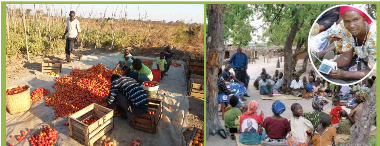
Radio listening clubs can play an important role in boosting production