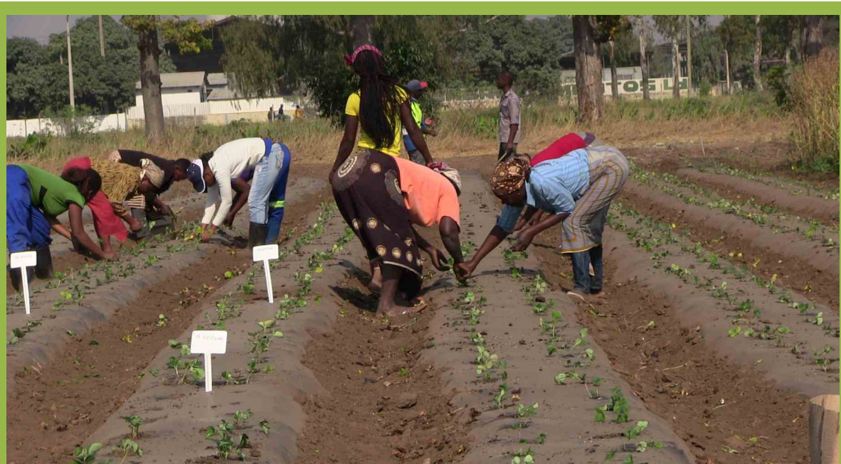
Field trip to Umbeluzi Agricultural Station (20km southwest of Maputo in the Boane district within the Maputo Province) during training on improving agricultural reporting for the media in June 2015