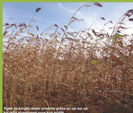
Tiges de sorgho blanc produits grâce au zaï sur un sol jadis abandonné pour son aridité