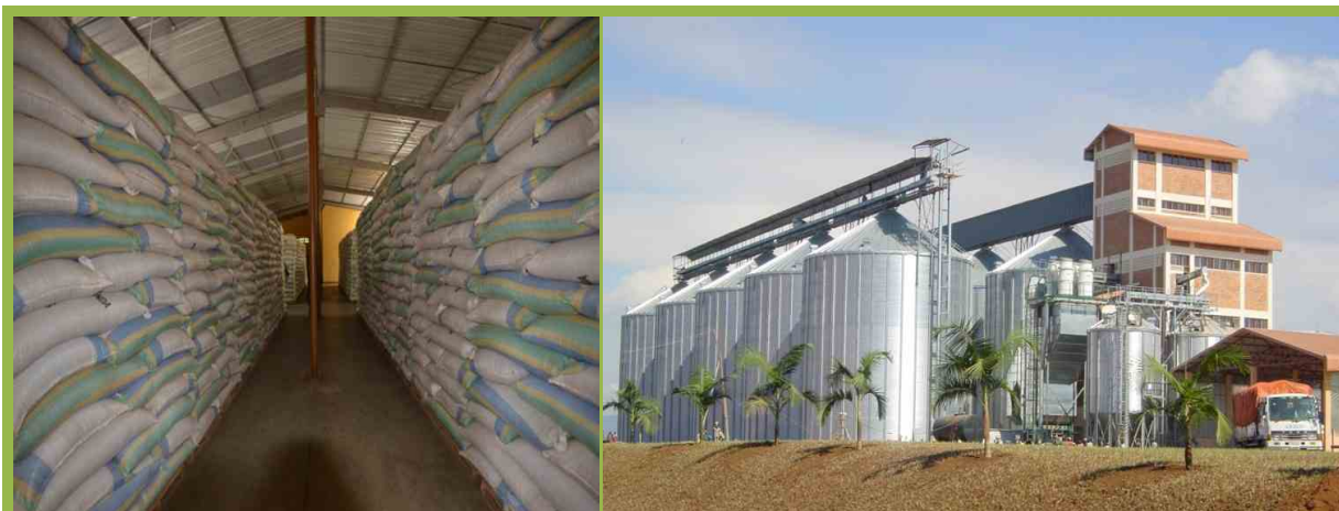
Crop intensification programme – Losses have been reduced from 35% to 13% for maize and 15% to 5% for rice