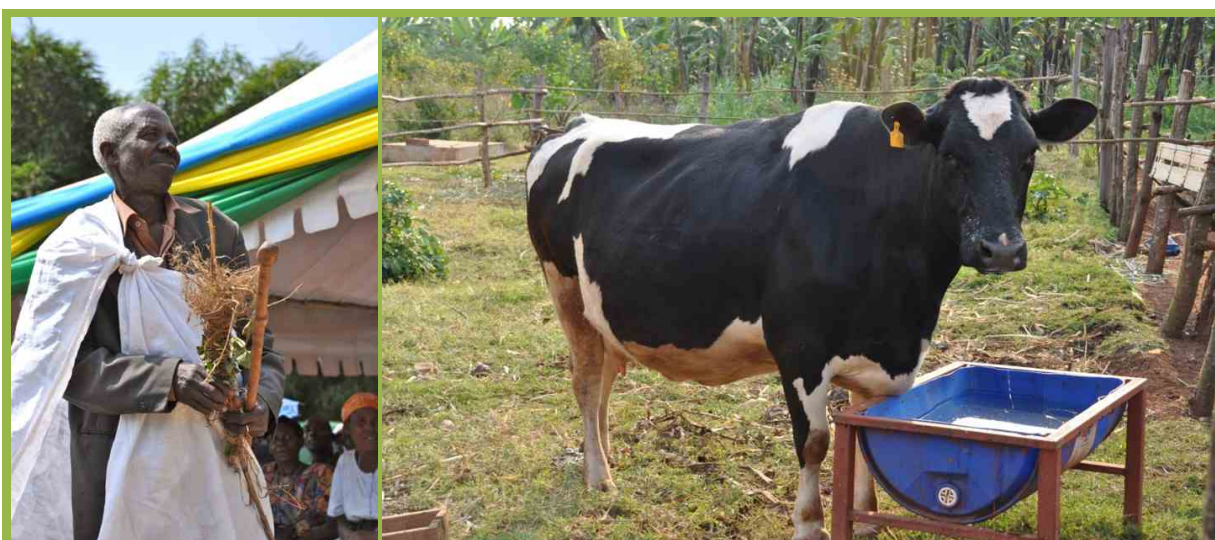
One cow per poor family has reached 250,000 households