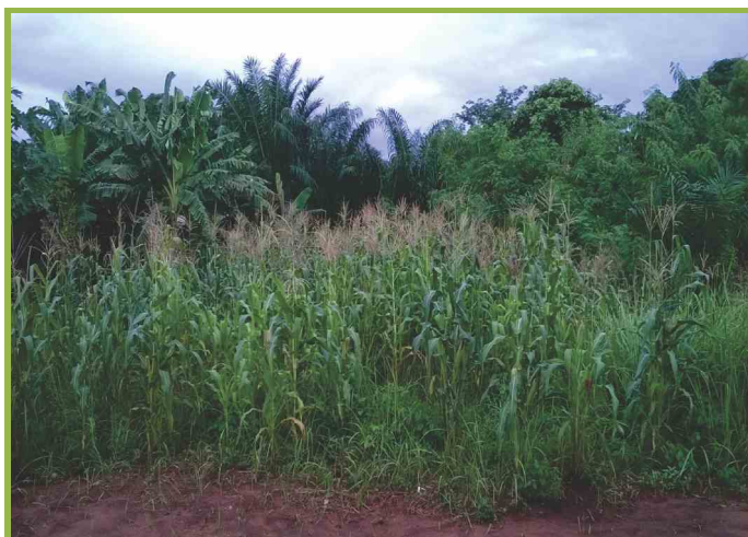
Maize field in Benin

However, in Banikoara (the Beninese cotton basin), the Ministry of Agriculture, Livestock and Fisheries has identified some major challenges that first need to be tackled to improve its agricultural revival initiatives. These include mitigating the adverse climatic effects. In 2015, for example, the drought had a negative impact on agricultural production. Focus also needs to be given to effective water management, improving yields and agricultural productivity, the improvement of family farms and the wide promotion of agricultural entrepreneurship.