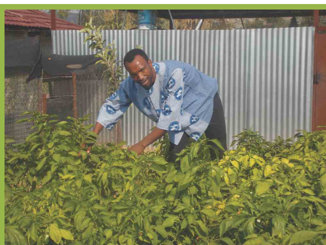
Farmer in Lesotho survives drought