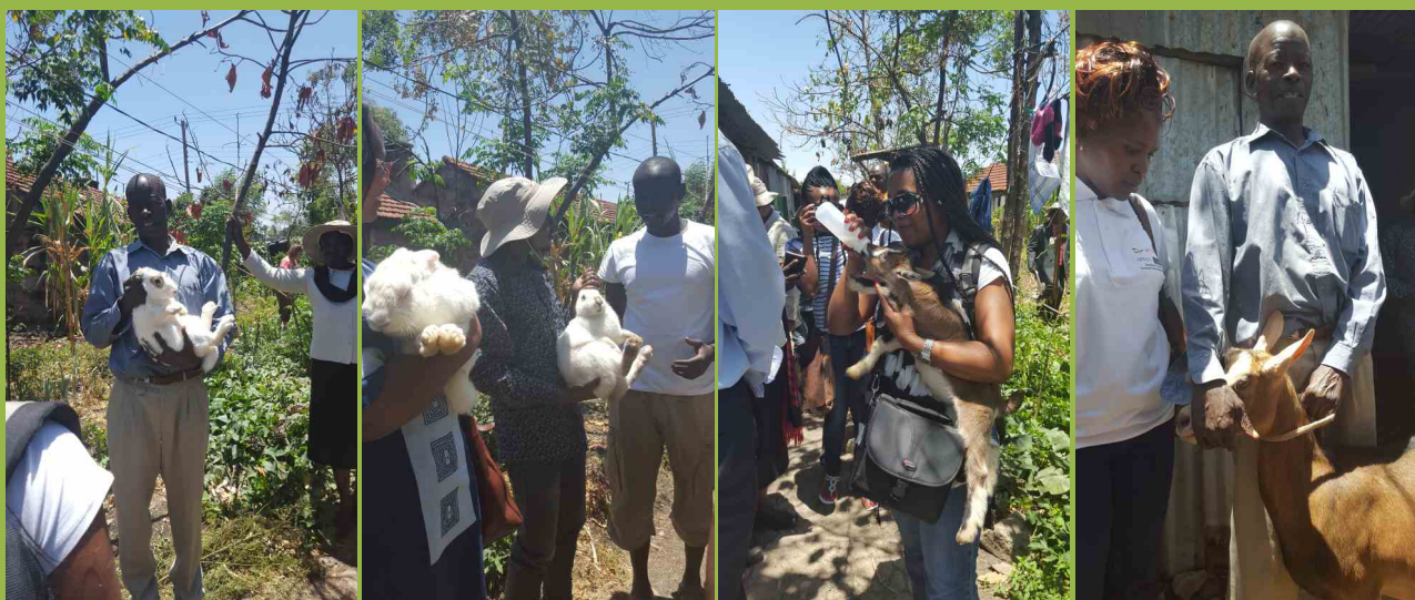
Changing mind-sets through urban farming