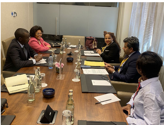
Meeting with the CEO of the Development Bank of Southern Africa (DBSA)