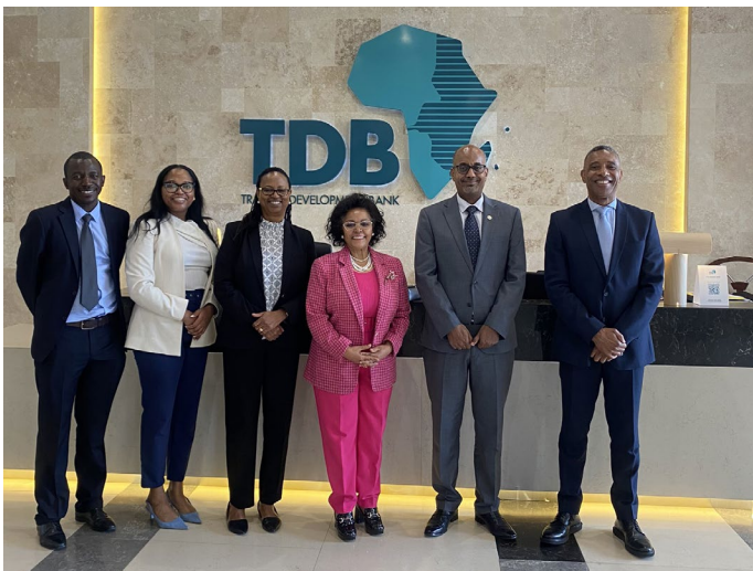
Meeting with Trade and Development Bank (TDB) Officials