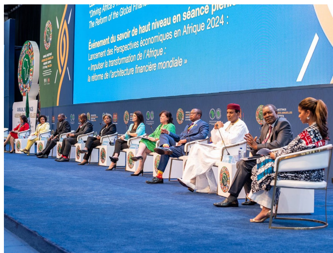
Meeting with the CEO of the Development Bank of Southern Africa (DBSA)