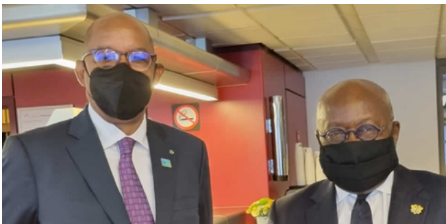
The AUDA-NEPAD CEO, Dr Ibrahim Mayaki led the Agency's delegation to the 6 th AU-EU Summit in Brussels, Belgium