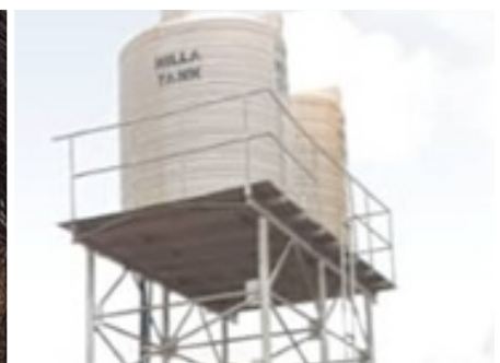
Installed borehole with over head reservoir system integrated and driven by the energy system