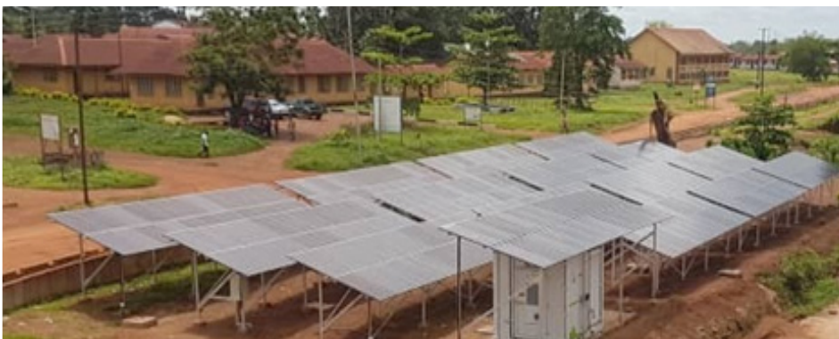
Installed solar Pv System

The next activity to be undertaken under this project is an inspection by the AUDA-NEPAD inspection team, led by the Environmental Sustainability Division in collaboration with the service provider, Ministry of Energy, Planning, Agriculture and National Project Steering Committee of Sierra Leone with the facility commissioning and handover.