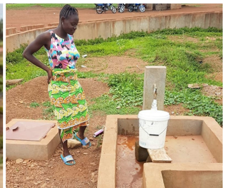
Installed borehole with over head reservoir system integrated and driven by the energy system