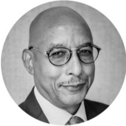
- Dr. Ibrahim Assane Mayaki CEO, AUDA-NEPAD

“The AUDA-NEPAD’s PIDA Quality Label reflects projects’ adherence to international best practices in infrastructure development. Building synergies between the PIDA Quality Label and SOURCE is an excellent opportunity to support project preparation and enhance infrastructure delivery in Africa.”