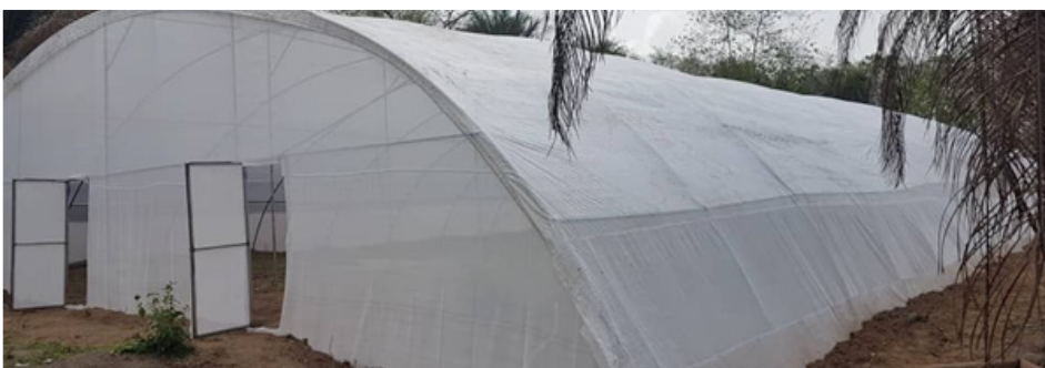
Installed greenhouse with irrigation system integrated and driven by the water supply from the borehole