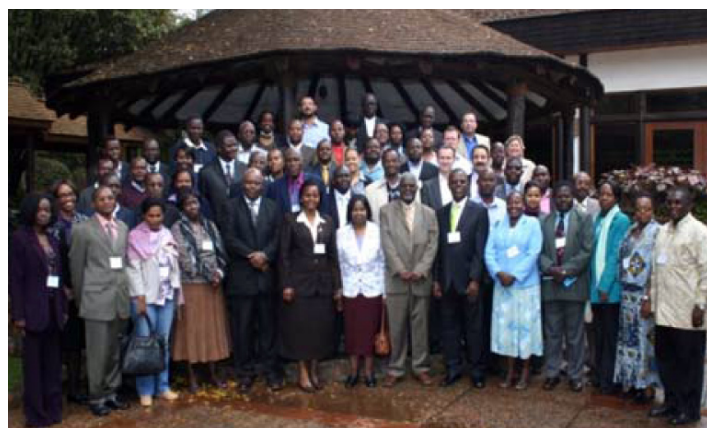
Participants at the Preparatory Workshop for African delegates to COP-MOP 5 in Nairobi, Kenya on August 25-27, 2010.