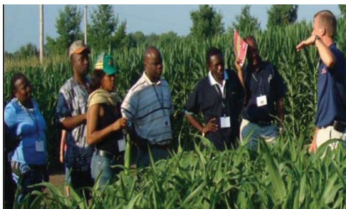
African regulators at the Environmental Biosafety Short Course in Michigan State University on July 25-30, 2010.