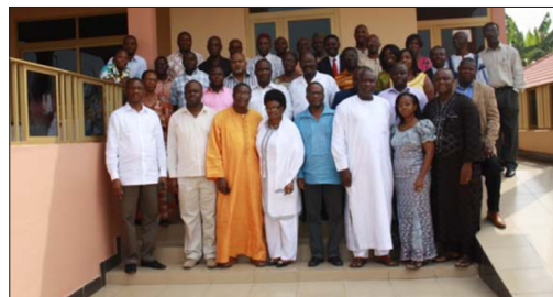
Participants at the sensitization meeting for Ghanaian legislators. Below, a cross-section of stakeholders at the meeting in Nigeria.

The sensitization workshop in Ghana was held on January 21-23 at Koforidua and was organized by Forum for Agricultural Research in Africa's project for Strengthening Capacity for Safe Biotechnology Management in sub-Saharan Africa (SABIMA) under the auspices of the Ministry of Environment, Science and Technology and supported by AU-NEPAD Agency's African Biosafety Network of Expertise (ABNE). The sensitization meeting for Nigerian stakeholders was held in Abuja and was organized by the National Biotechnology Development Agency (NABDA) under the auspices of the Ministry of Science and Technology with support from biosafety/biotechnology initiatives and institutions including the AU-NEPAD Agency's African Biosafety Network of Expertise, the African Agricultural Technology Foundation (AATF), the USAID-IFPRI Program for Biosafety Systems (PBS), and the Donald Danforth Plant Science Center. Ghanaian and Nigerian legislators pledged their commitment to expediting action to establish the much needed legal framework for safe and responsible use of modern biotechnology.