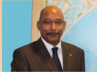
Dr Ibrahim Mayaki - NEPAD Agency Chief Executive Officer

The main features of the African Union/NEPAD governance structure include the African Union Assembly of Heads of State and Government, the NEPAD Heads of State and Government Orientation Committee and a steering committee.