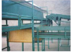
DROP-BELT GRADING CONVEYOR & TRANSFER CONVEYOR