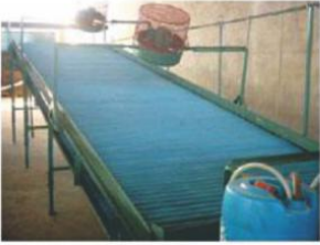
8m x 2m DRY TUNNEL