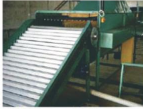
TAKE-OUT ELEVATOR & 24 BRUSH WASH DRIER.