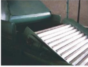
TAKE-OUT ELEVATOR IN FUNG BATH & 16 BRUSH DRIER