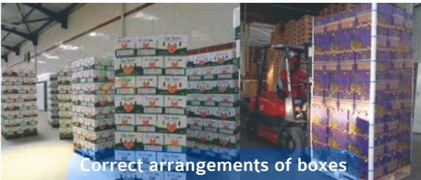
Correct arrangements of boxes

The most common size used internationally is 120 x 100 cm. It is sometimes made of plastic materials. Depending on the packaging dimensions, a pallet may hold from 20 to 100 units.