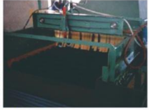
8 BRUSH WAXER