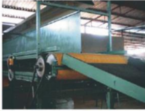
10m or 12m DROP-BELT GRADING CONVEYOR