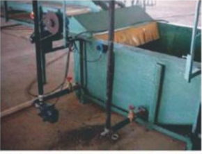
FUNGICIDE BATH & PIPEWORK