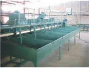
7 or 10 BIN SECOND GRADE SIZER