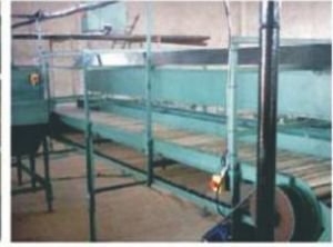
PRESORT ROLLER CONVEYOR