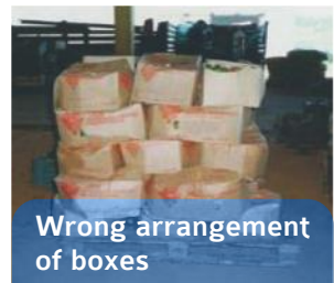
Wrong arrangement of boxes