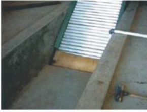
TAKE-OUT ELEVATOR IN DUMP TANK.