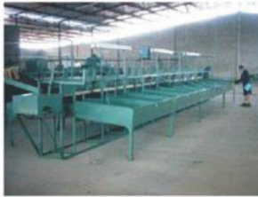
20 BIN FIRST GRADE SIZER